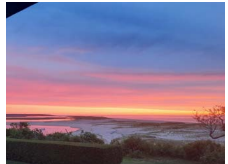
Nauset Inlet at sunset