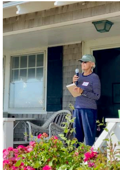
July 2022 member meeting