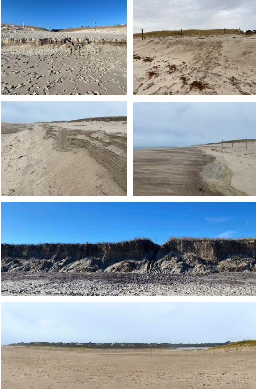
Erosion on the North Spit and base of Callanan's Pass Oct 2022 - March 2023

It is unknown if there will be OSV access to the beach this summer. Stay tuned for updated plans regarding the Beach Bonfire event scheduled for July 15th.