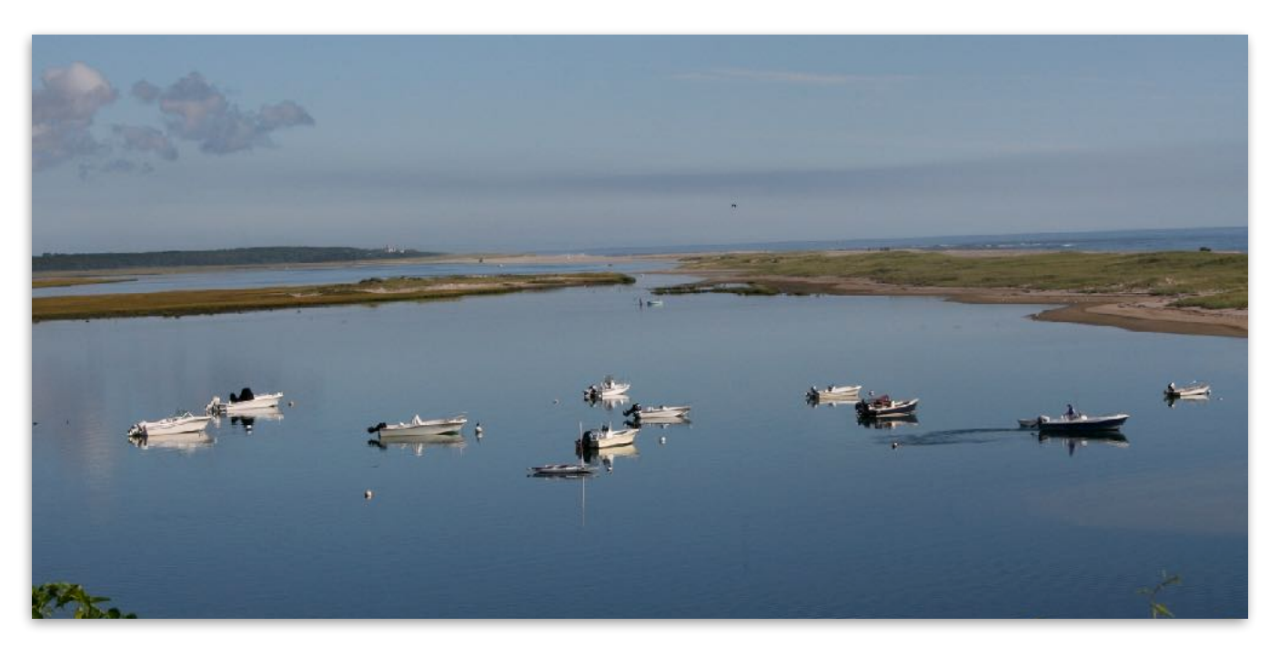
NHA Spring 2021

The DRAFT EENF contains a comprehensive proposal for the dredging of a main channel between Town Cove and Nauset Inlet as well as a spur channel from the main channel to Priscilla Landing and a spur channel from Priscilla Landing to the Mill Pond. The document describes the many alternatives that WHG evaluated in developing the EENF and the large number of studies that WHG completed for the Town. The (continued on page 3)