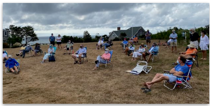
Socially distanced August 2020 member meeting under stormy skies

The NHA reaches out and welcomes newcomers to our neighborhood. We ask that if you are selling your home or if you know of a neighbor who is selling or has sold their home, please pass along the new owners' information to our general email address: nha@nausetheights.org. The membership committee has created a welcome packet and we'd appreciate your help in making sure we are able to get it into our new neighbors' hands.