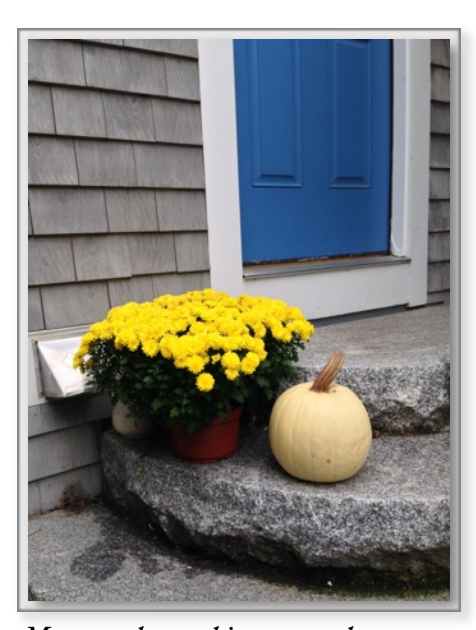
Mums and pumpkins on our doorsteps